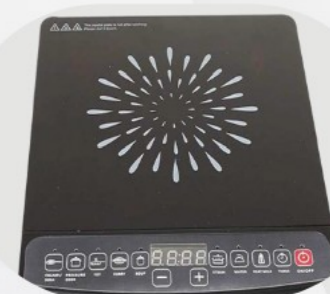
PORTABLE LIGHT WEIGHT