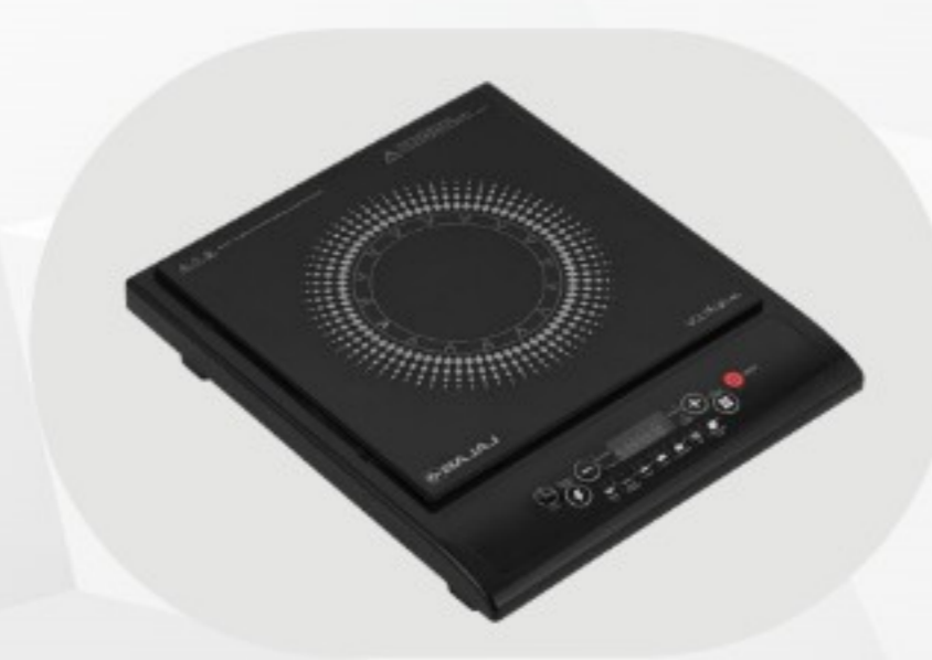
PORTABLE LIGHT WEIGHT