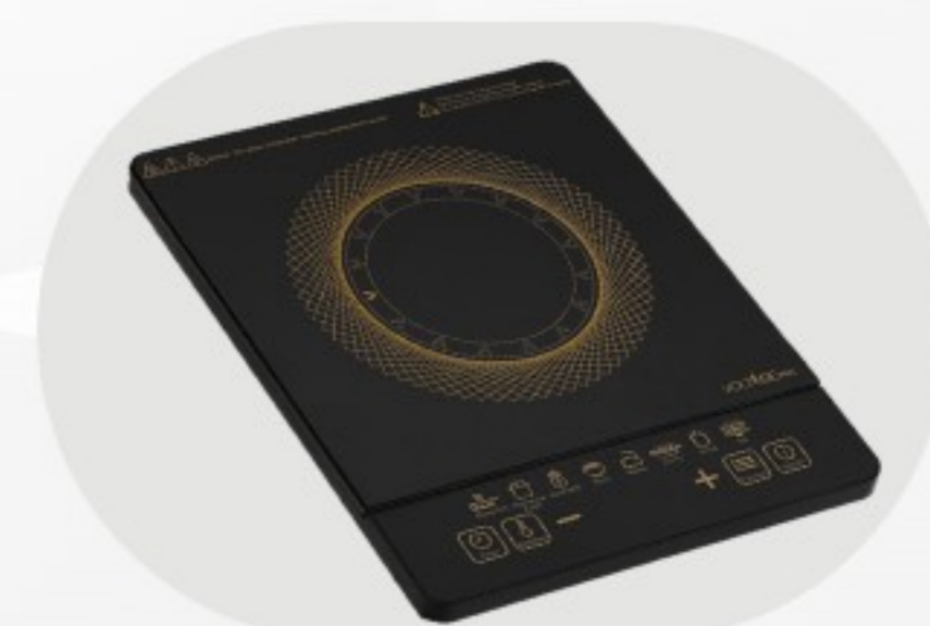
PORTABLE LIGHT WEIGHT