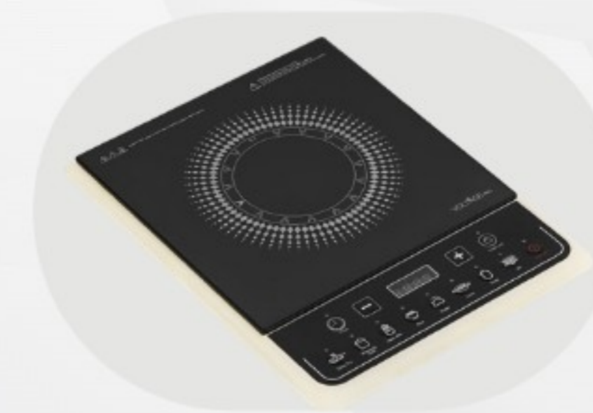
PORTABLE LIGHT WEIGHT