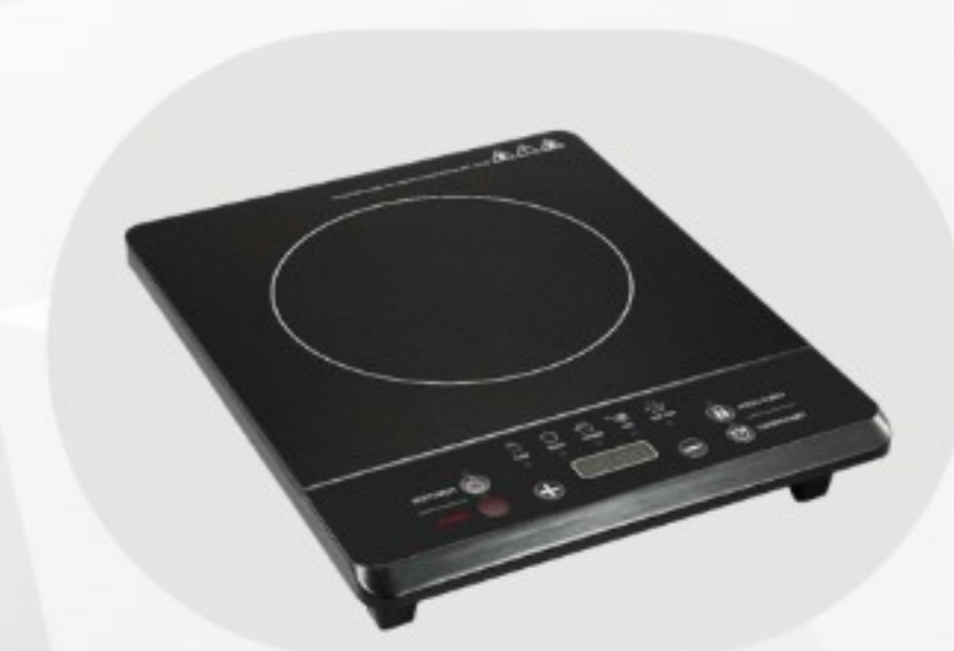
PORTABLE LIGHT WEIGHT