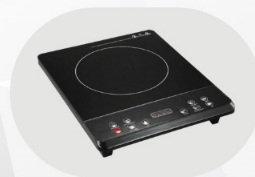
PORTABLE LIGHT WEIGHT