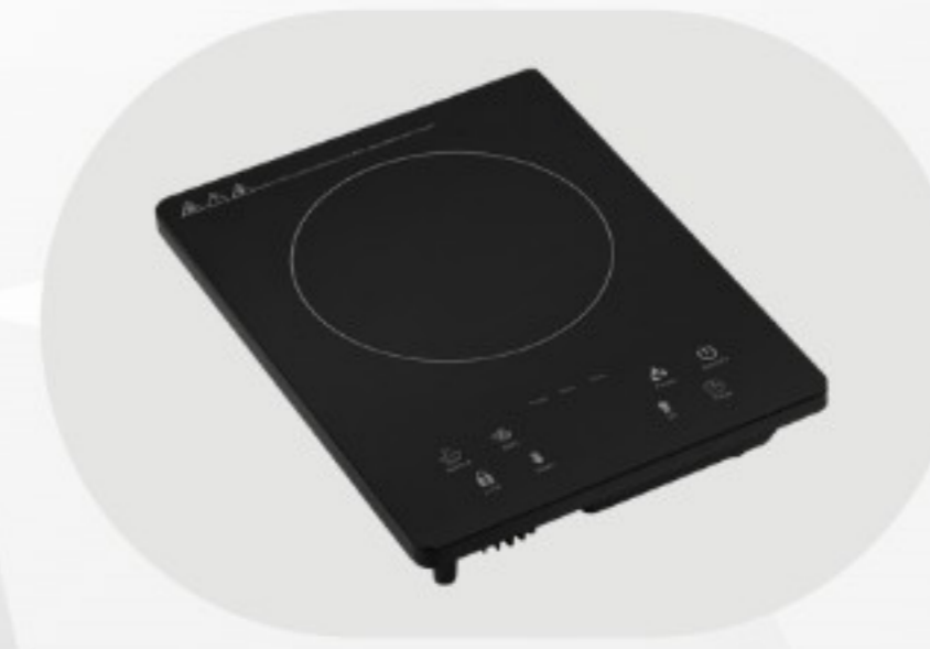
PORTABLE LIGHT WEIGHT