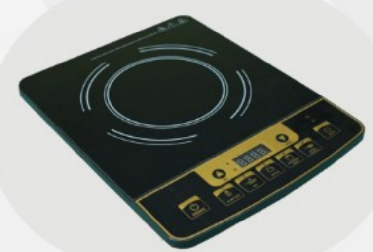
PORTABLE LIGHT WEIGHT