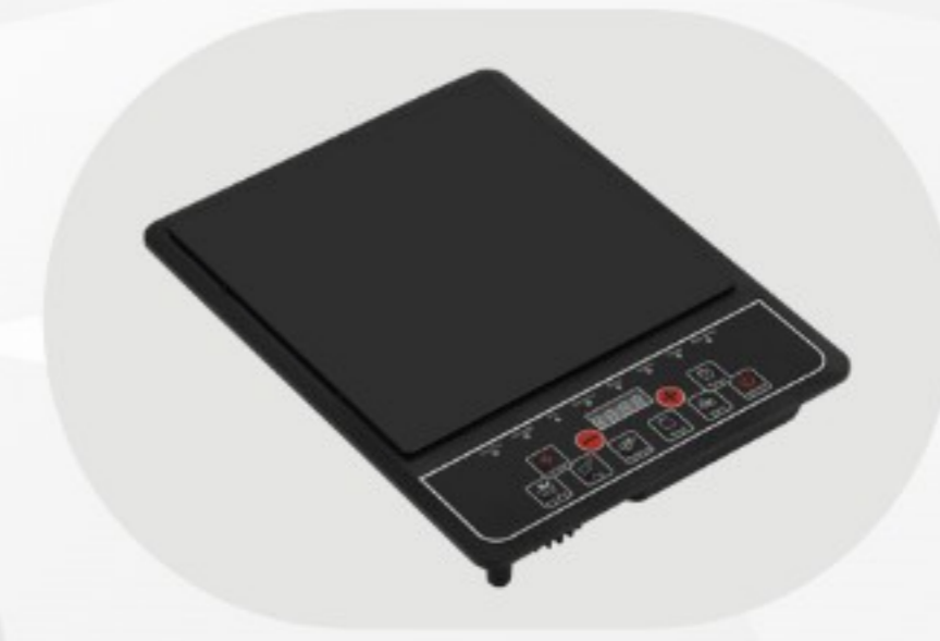
PORTABLE LIGHT WEIGHT