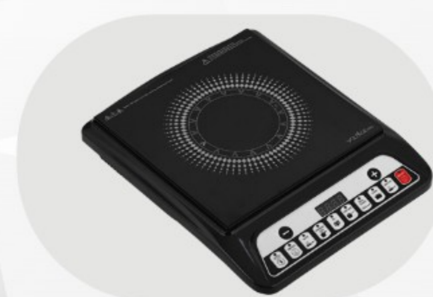
PORTABLE LIGHT WEIGHT